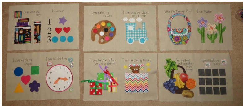
Quilts are definitely NOT the only things I sew...