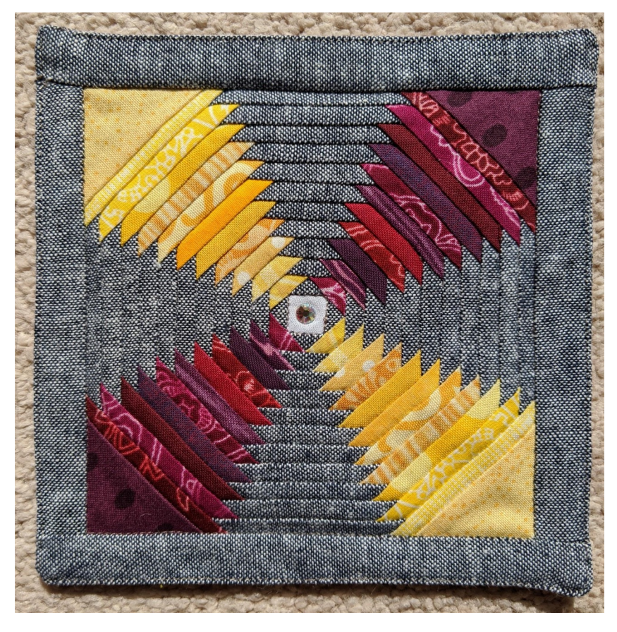
Travelling Pineapple, October 2019