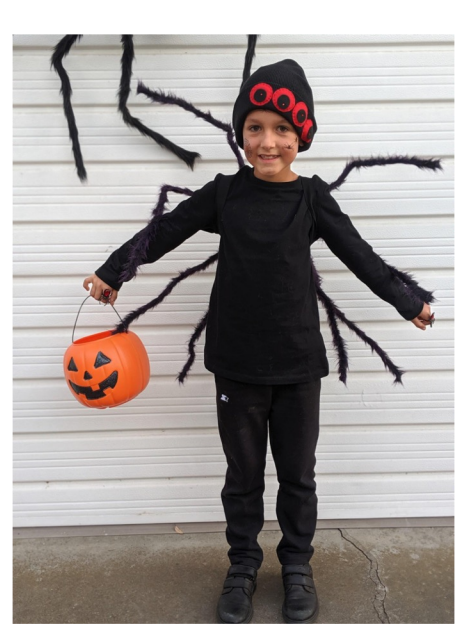
I also make Hallowe'en costumes!