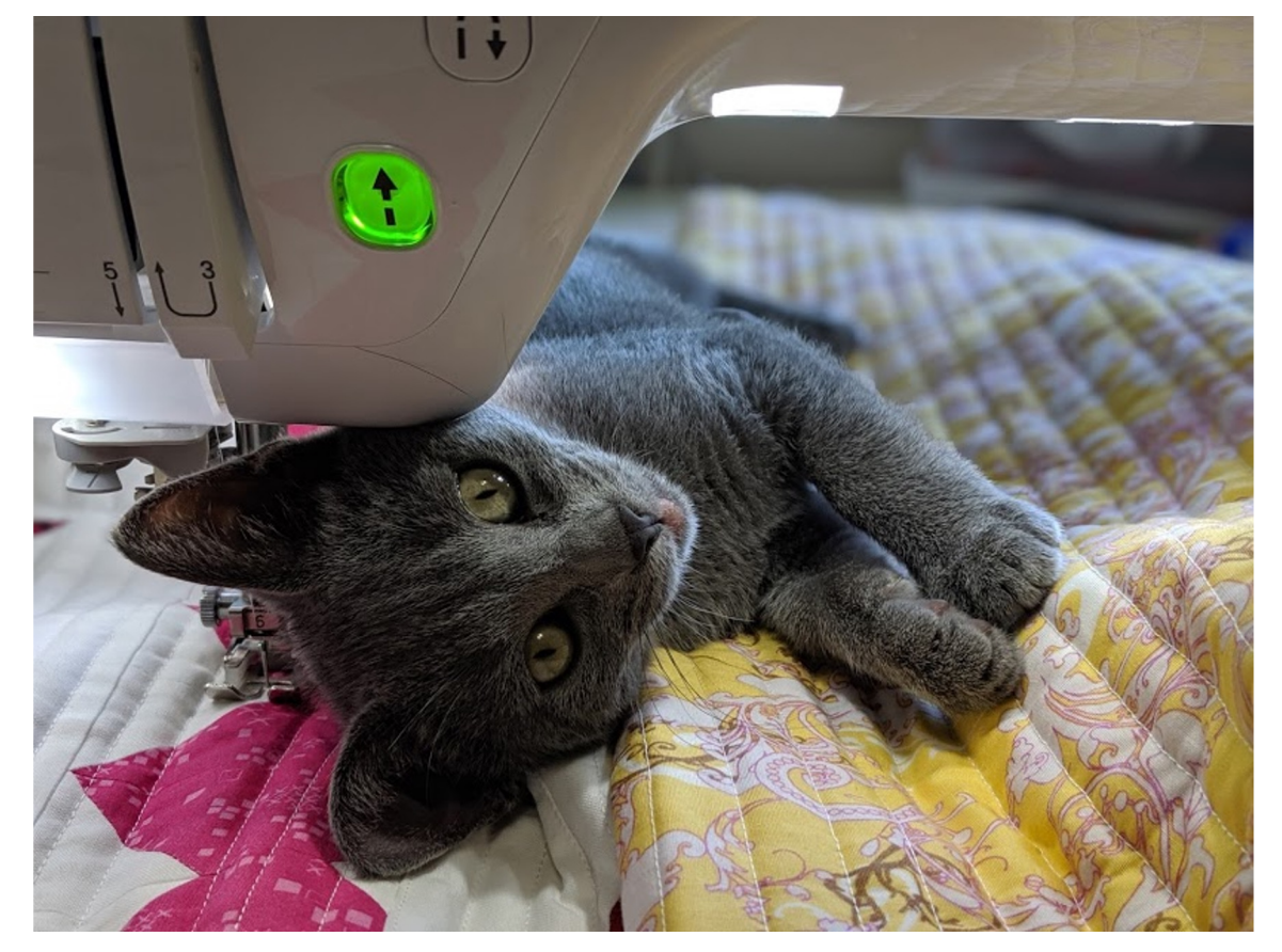
I have very cute 'helpers' these days...